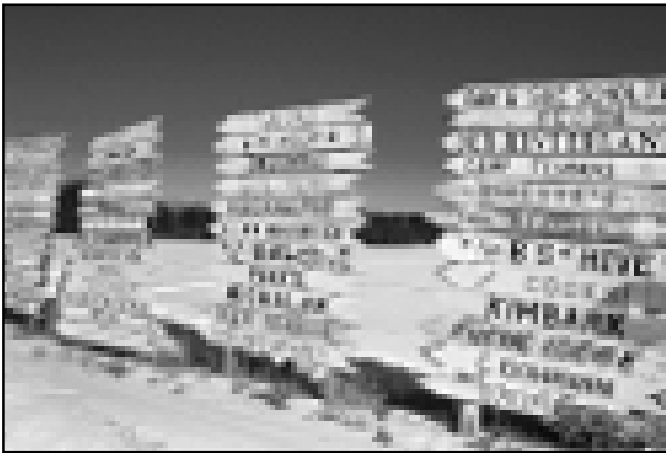
Lakes have as many issues as signs represented here.

These groups were asked to rank the importance of a variety of lake issues from one (extremely important) to five (not at all