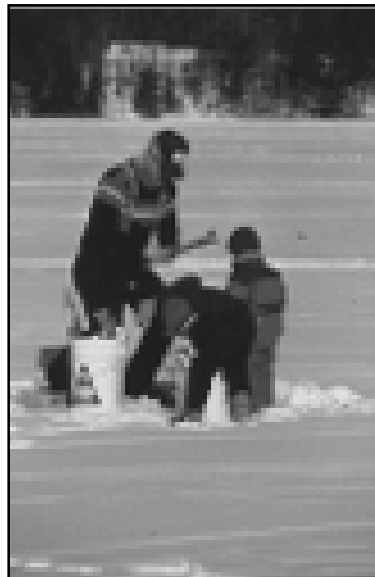
A favored winter pastime.

They looked at lake characteristics such as the number of cottages, property values, lake size, and the number of extremely important or very important lake management issues.