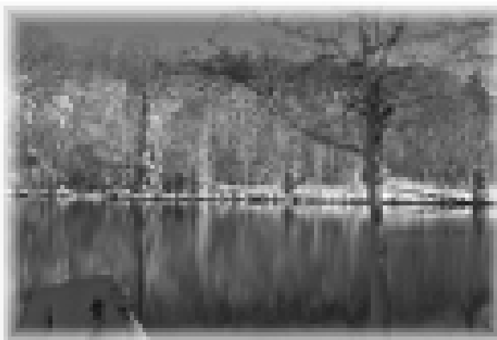
Wisconsin's Year of Water

Wisconsin's dialogue on water continues.