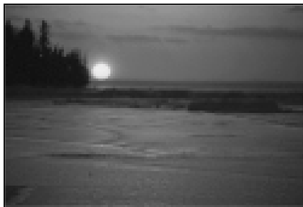
What does the future hold for lake organizations?

Only the number of cottages and membership sizes were significantly correlated with the number of management activities initiated.