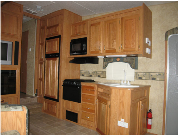
Oak Cabinets throughout