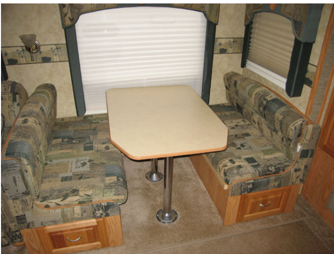
Dinette seats 4, and has two slide out seats on front