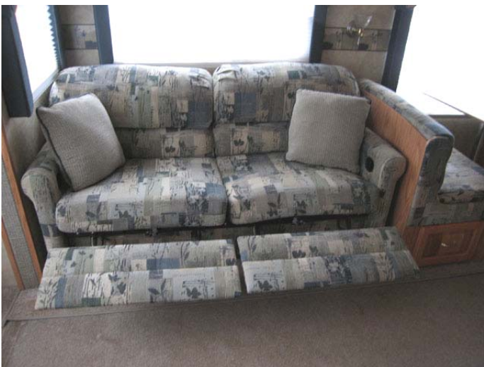
Couch with double recliners