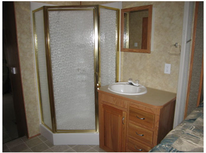
Full size shower