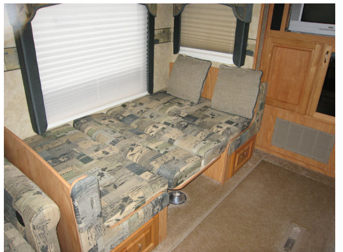
Can turn into small sleeping area