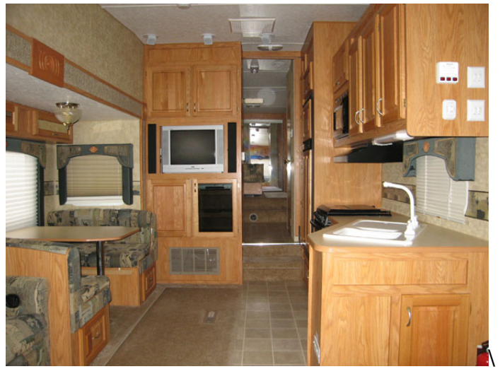
Dinette and Living room slide out