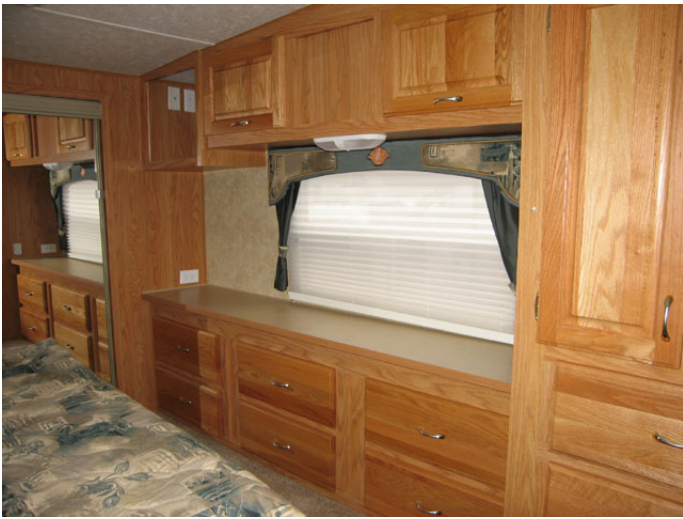
More Cabinets in Bedroom