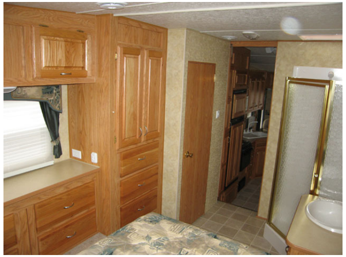
Lots of cabinets