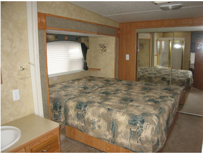
Queen sized Bed with slide out privacy curtain