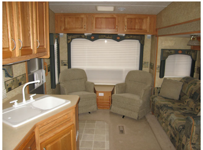
Step down with pocket door to Living area