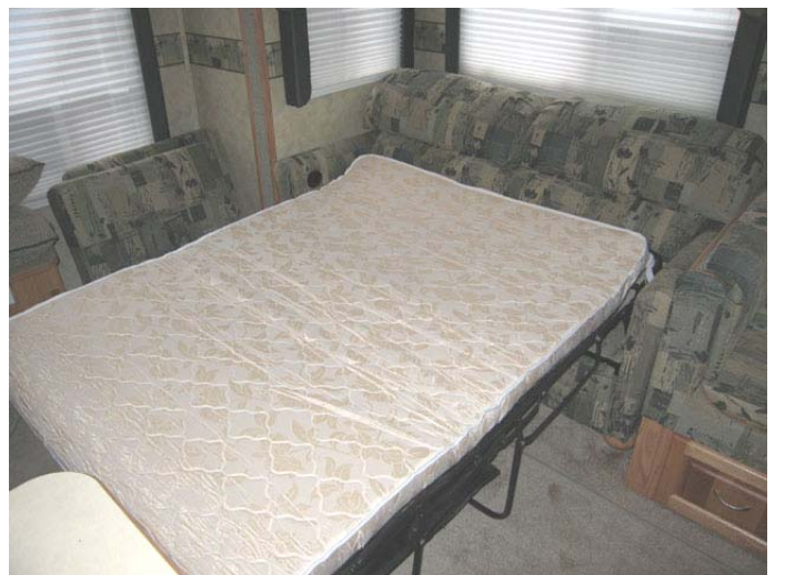
Makes into Queen Bed (have changed mattress for air bed)