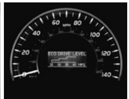
Camry Hybrid has a much higher EPA-estimated mpg rating.