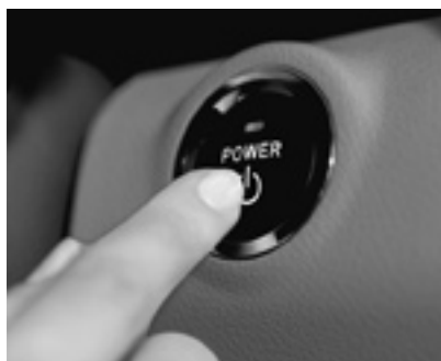
Smart Key System with pushbutton start is available on Camry XLE and Camry Hybrid.