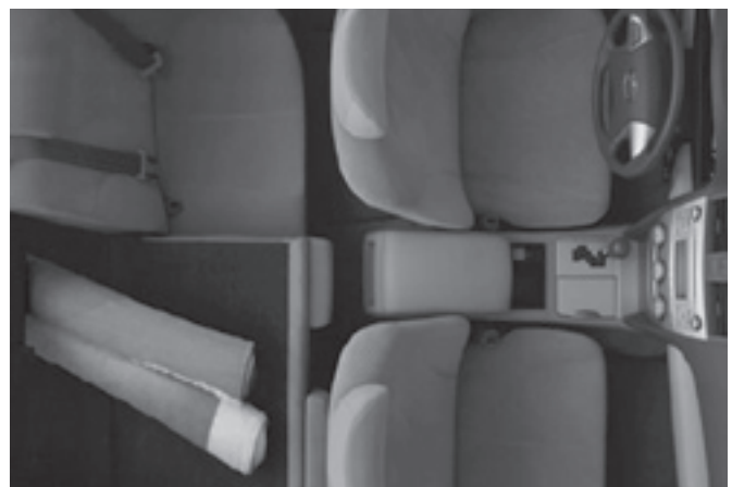
Camry's 60/40 split-folding rear seat.