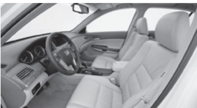
Front active head restraints come standard on Accord.

Accord comes standard with front active head restraints, a feature that Camry doesn't offer. The head restraints move forward and up, to help reduce a neck injury in rear collisions.