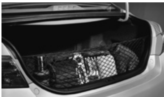
Camry offers more trunk space than the Accord.