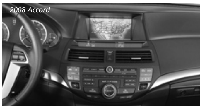
Camry's DVD-based touchscreen navigation system may be easier to use than Accord's system with interface dial.