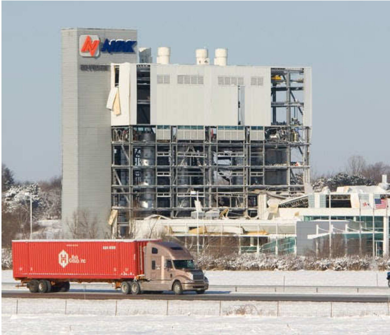
View from Tollway Overpass 12-10