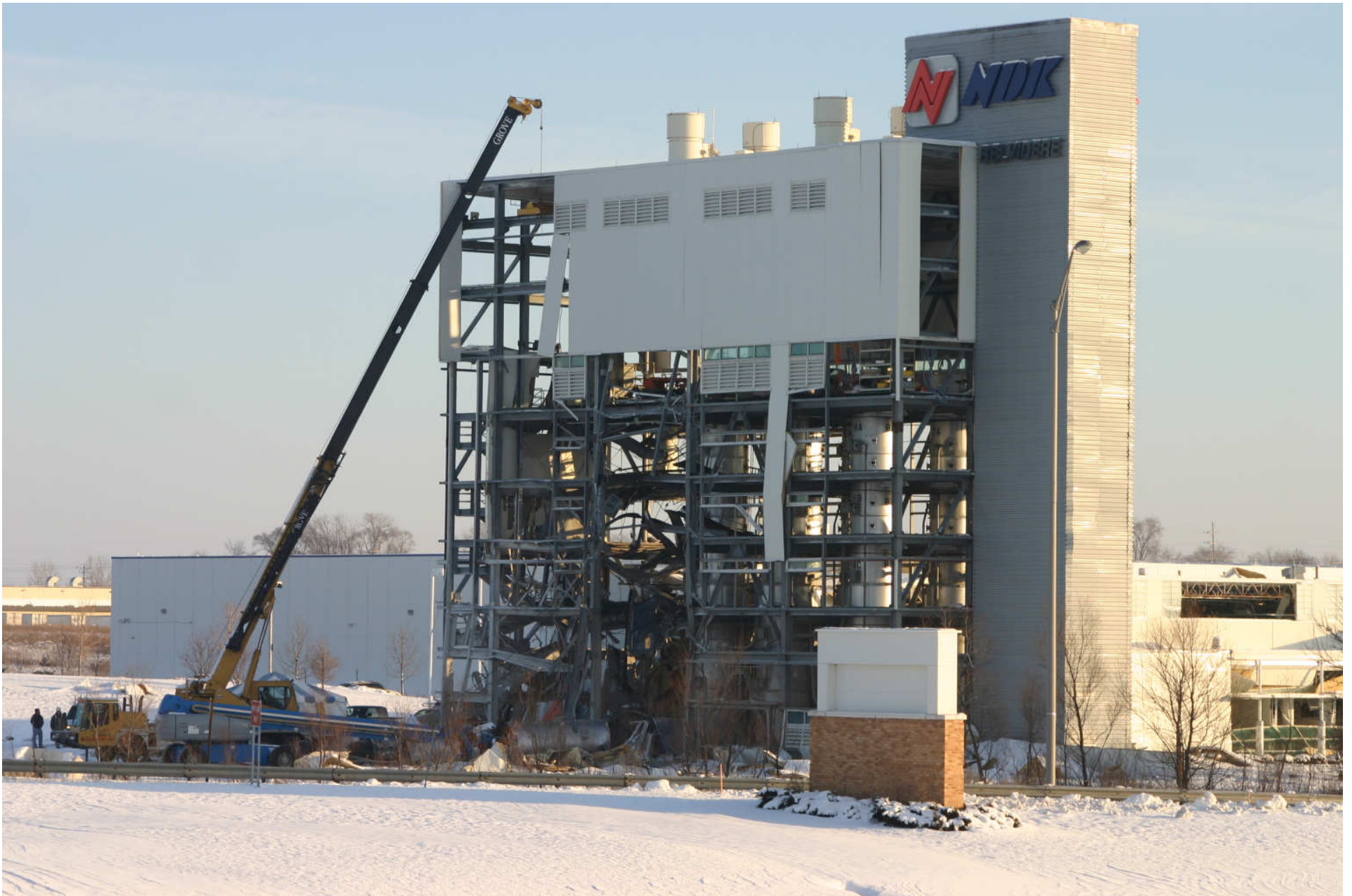
View from Oasis 12-12