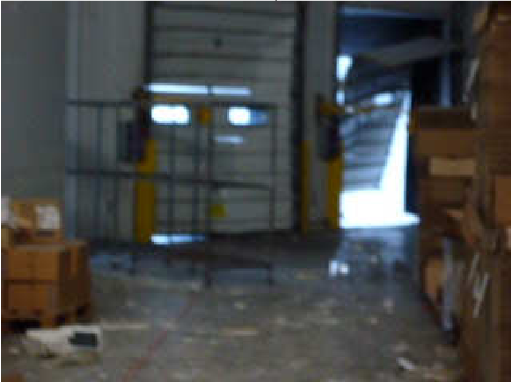
Receiving dock doors – blown out by explosion