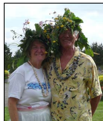
A couple of "natives" ready for the luau (hope that isn't poison ivy)!

In the evening, we gathered in the club house for the Classic RV Club version of a luau – as usual, lots of good food! And of course there was birthday cake in honor of our seventeen years as a club and our traditional gift exchange.