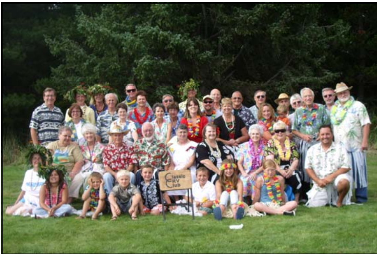
The 2009 Classic RV Club Group photo!

NOTE: Limited space prevents us from showing all the pictures from this campout; check out the Photo Gallery on the club website for additional pictures: