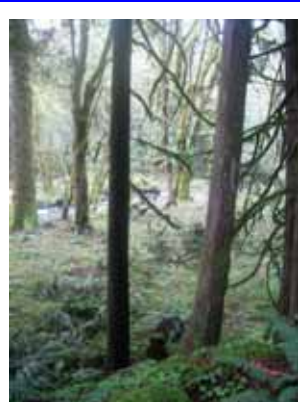
Forest beauty around Cougar, WA.