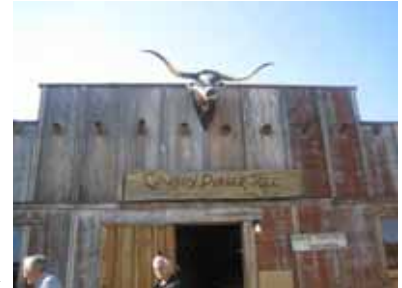
Cowboy Dinner Tree.

June... We headed south for the tracks... train tracks that is at Train Mountain in Chiloquin, OR. Several of us stayed at Cascade Meadows in LaPine on Thursday so we could go to the Cowboy Dinner Tree Restaurant in Silver Lake, OR. We ate and ate and still went home with bags of food.