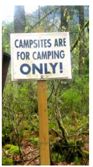
Well Duh! What else would you do in a campground?