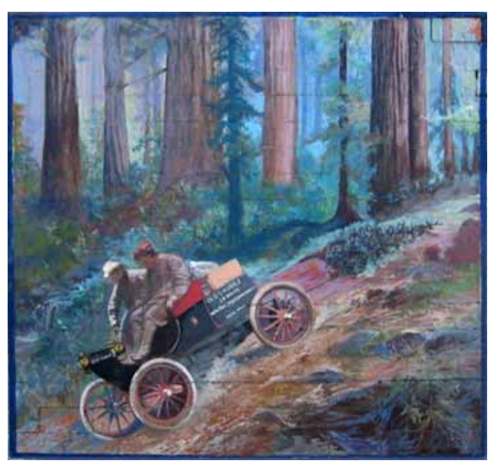
Old Scout mural in Sweet Home, OR.