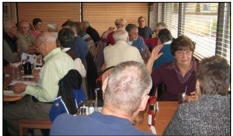
Even though the room was crowded, we had a good time visiting around the tables and eating lunch.