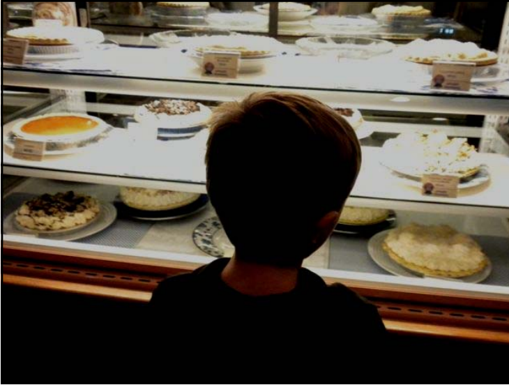
Checking out the pies – which one should I have?