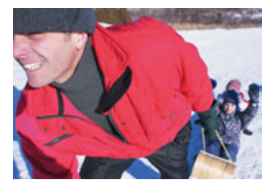
Counter the effects of stress with energetic family play.

6. Take an afternoon or evening to enjoy being rather than doing. Immerse yourself in a favorite activity for a few hours, whether that's reading in front of the fireplace, strolling in the woods or through a museum, or getting a facial or pedicure.