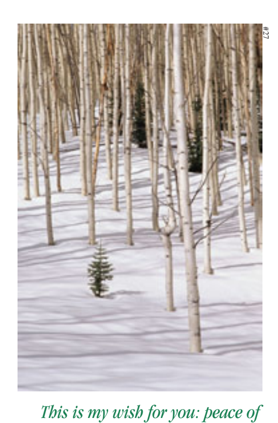
mind, prosperity through the year, happiness that multiplies, health for you and yours, fun around every corner, energy to chase your dreams, joy to fill your holidays!