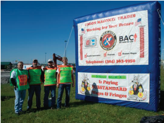
Local #1 Wheeling members picket against Debello Masonry on the Sheetz project in Wheeling, WV.

Since the last newsletter, organizing in West Virginia has become more crucial to members, contractors and the District Council. The downturn in the U.S. economy has caused owners and developers to put projects on hold or to cancel them altogether, creating a market that is seeing fewer and fewer projects bidding and more and more competition for the few projects that are bidding. The slow down has helped open the markets that our contractors once controlled, to contractors that are willing to take advantage of workers rights and that would do anything to turn a fast buck. We not only deal with these contractors, but also with the owners and businesses that try to exploit these situations, by shopping our competitive bids to other contractors, looking to undercut one price with another and then another, when finally you have a contractor that pays next to nothing and survives off the miseries and misfortunes of their employees who are just hoping to get by until their next check.