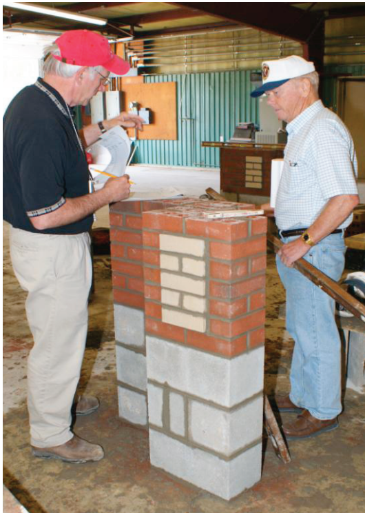
Judges meticulously score a project.

On Saturday, April 25, 2009, the District Council of WV J.A.T.C. held its annual apprentice competition at the training center in Harrisville. Apprentices from around the state competed in three different categories according to their total number of on-the-job training hours. First and second place prizes were awarded for each category.