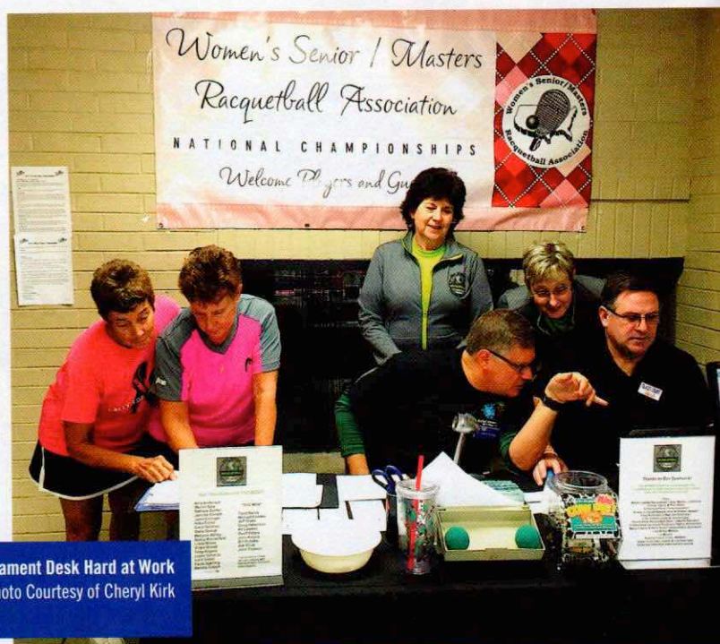
Tournament Desk Hard at Work

So 80 players ages 36-76 arrived from 21 states and Guatemala (which actually made this an INTERNATIONAL event). The round robin format ensures play on every day of the three-day tournament. The women competed in singles and doubles age divisions -- seven round robins and three pool-play-with-playoff formats. Forty-eight played in both singles and doubles (see "exercise" in Q1).