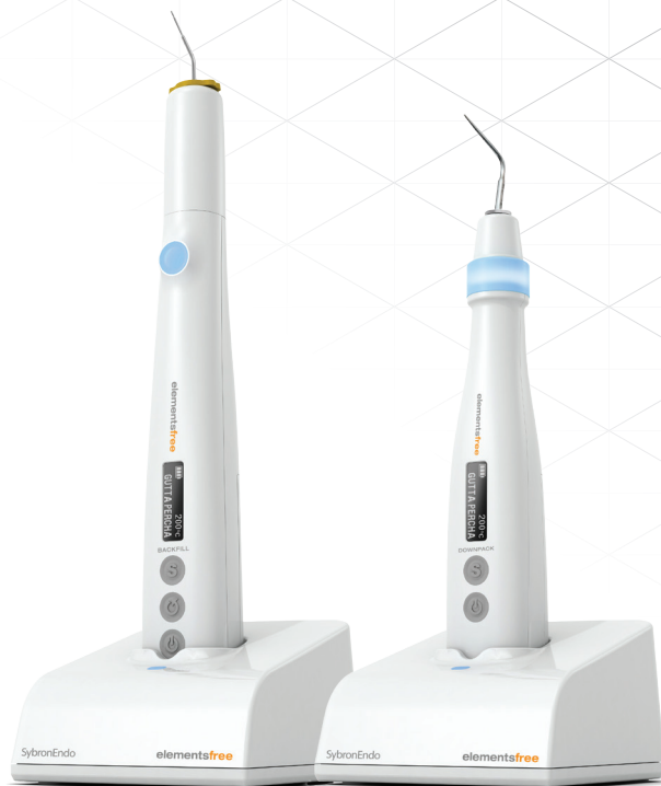
Single Charging Base