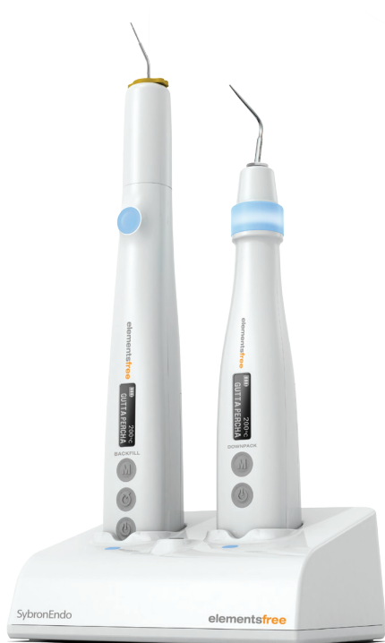
Dual Charging Base

n., Powered obturation with no strings attached